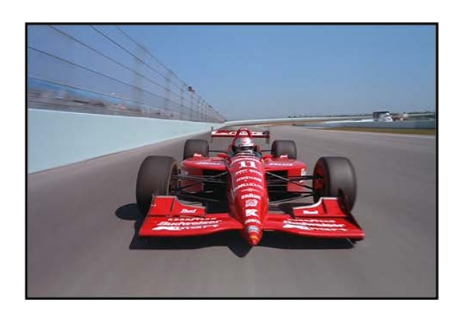
Figure 2. 60Hz vs. 120Hz ClearMotion