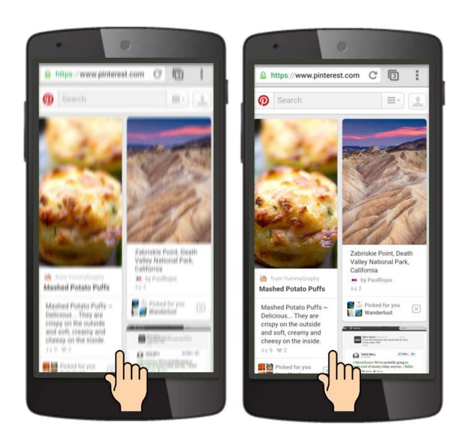
Figure 1. Motion Deblurring: Traditional 60Hz vs. MediaTek 120Hz

The 120Hz display improves motion clearness, especially on web browsing, video playback and 3D gaming scenarios. In the Video playback scenario, MediaTek also applies 120Hz ClearMotion™ for frame rate conversion. ClearMotion technology eliminates motion jitter and ensures smooth video playback. 120Hz display also shortens the response time which can also increasing user experience. The images below demonstrate these features.